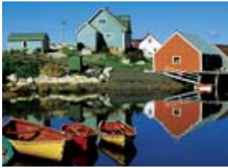
Peggy's Cove – explore the brightly colored houses nestled close to the water's edge in this working rustic fishing village.

◆ 7-Night Canada Cruise ◆ Cruise from New York City ◆ September 12, 2009