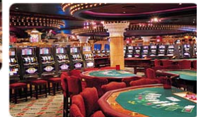
Left – The Rome Lounge Center – London Dining Right – Club Monaco Casino